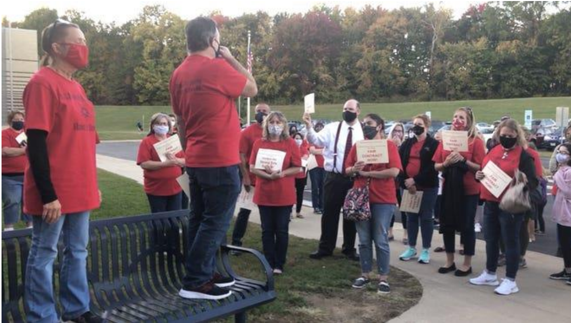
ABOVE: Streetsboro's two unions – the Streetsboro Education Association and the Streetsboro School Support Personnel Association – voted to approve a 10-day strike notice Monday (October 12, 2020). The unions can now file an intent to strike notice at any time.

In May, the unions notified the district the intention of negotiating COVID related items, and again in July and August. In mid-September, the board told the unions it had "no intention to bargain over health and safety standards, including those related to COVID-19."